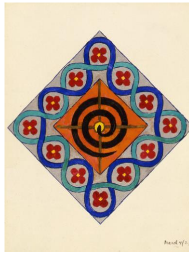
039-BMEB